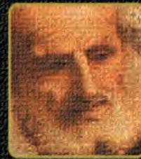
James, son of Zebedee