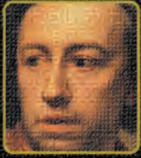
James, son of Alphaeus