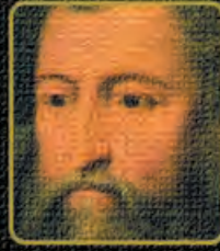
Simon the Zealot