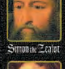
Simon the Zealot